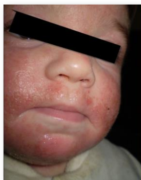
Helping thousands and thousands of patients, and especially children.